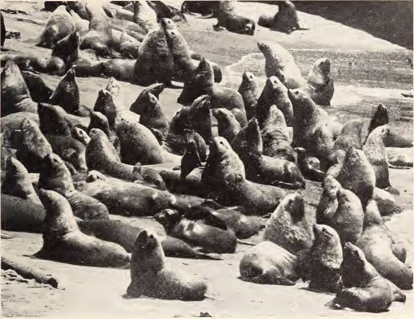
Fig. 2. A group of bachelor Steller sea lions on a sandy beach with some immature elephant seals and immature California sea lions. Several of the latter can be seen on top of the elephant seals. Año Nuevo Island, California, June 27, 1961

There was even closer contact between some of the last remaining California bulls and the subadult or bachelor Stellers which are kept from the breeding areas and forced to haul out on the inner reefs and sandy beaches occupied by California males